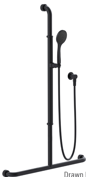
Drawn MF (Middle Fix)